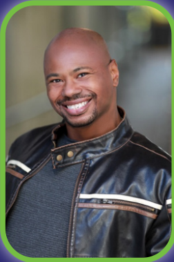
Lynn Atkins Bronze and Coppers