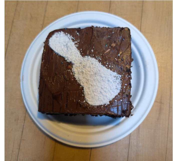
Powdered sugar on a brownie