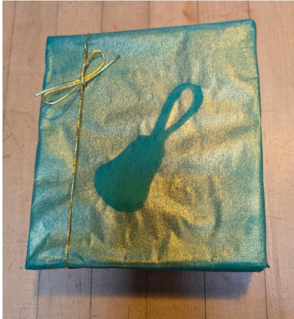
Festive gift wrap