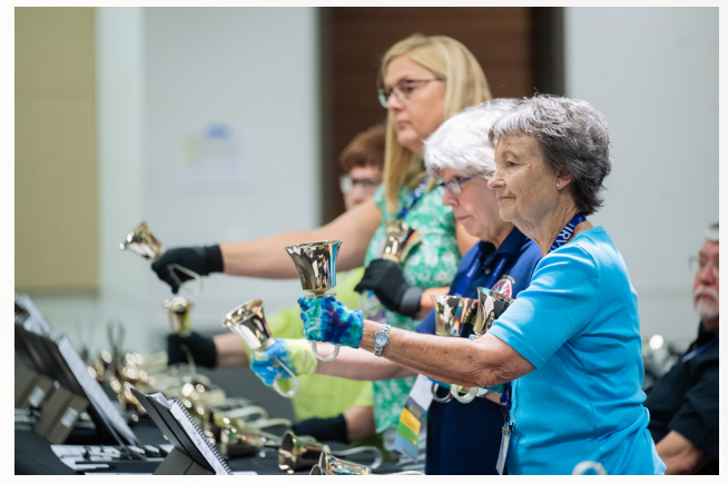
Attendees enjoy one of many techniques classes.