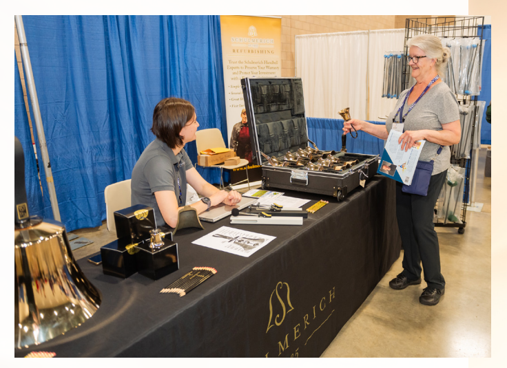
A participant tries out some Schulmerich handbells.